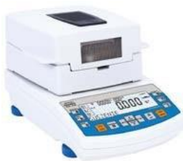
MA.50.R 0.001g - Infrared - max 160 °C Moisture Analyzer