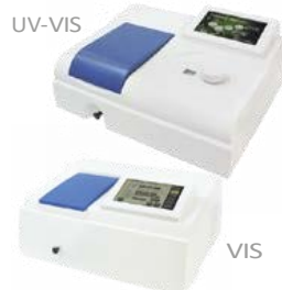
Uv And Uv-Vis Spectrophotometer