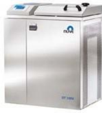
NC 100 VERTICAL TYPE STEAM STERILIZER

► Founded in 1968, NÜVE is one of the world's leading laboratory and sterilization equipment manufacturers.