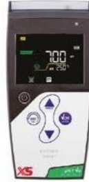
PH 7 Professional portable pH meter with high-resolution color display