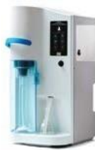
AutoKjel Autosampler - Automatic Kjeldahl Nitrogen Protein Analyzer

► Established in 1983 by Ermete Passoni, VELP Scientifica is today one of the world's leading manufacturer of analytical instruments and laboratory equipment