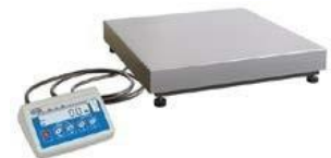
WLC 120/C2/K 2g Industrial Balances