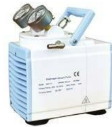
Gm-0.5 Vacuum Pump