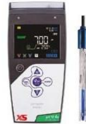
PH 70 Portable, computer-connectable pH meter and ORP meter with memory