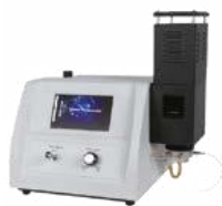
Fp6450 Series Flame Photometer