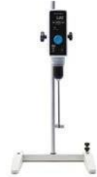
OHS 20 Digital Overhead Stirrer