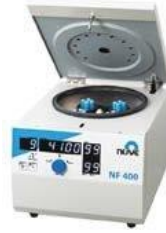
NF 400 TABLE-TOP CENTRIFUGES