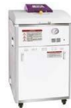
Kh 35 A Sterilizer Ldzf-30l