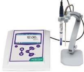
PH 80 Benchtop digital microprocessor-based pH meter and ionometer