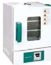
303 Oa Incubator