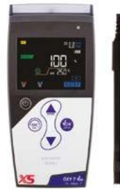
OXY 7 Vio Dissolved oxygen measurement, % saturation and barometric pressure with temperature indicator