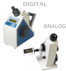
Abber Refractometer 2 Waj Analog Model Wya-2s Digital Model