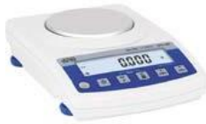
WTC 200 0.001g Precision Balances