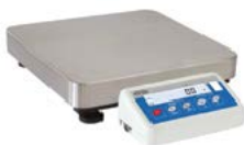
WLC 20/A2 0.1g Industrial Balances