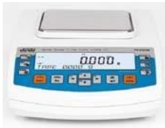
PS 210.R2 0.01g Precision Balances