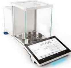
XA 52.5Y.A 0,01mg Analytical Balances