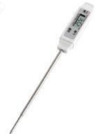
38.2013 Digital timer and stopwatch