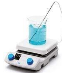
AREX 6 Connect PRO Hot Plate Stirrer