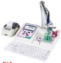
PH 8 Portable, computer-connectable pH meter and ORP meter with memory