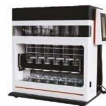
Sox606 Auto Fat Analyzer