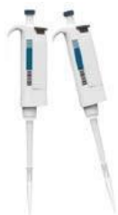
M8-10 Automatic Pipette