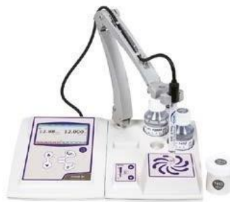
COND 8 Benchtop digital microprocessor conductivity meter with large backlit color graphic display