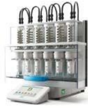
SER 158 Series Automatic Solvent Extractor