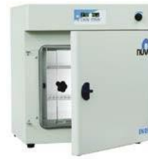
EN 120 STAINLESS STEEL CELL OVEN