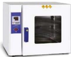
Autoclave Ldzm 40_ldzm-40l