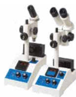
X4 Melting Point Tester_sgw-X4b