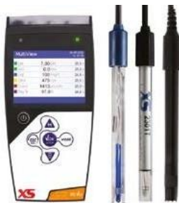
REVio Professional, portable, pH, mV, ORP, ISE, conductivity, TDS, salinity, resistivity, dissolved oxygen and temperature measurement.