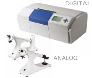
Polarimeter Wxg-4 Analog Model & Digital Model