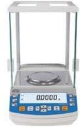
AS.220.R2 PLUS 0,1mg Analytical Balances