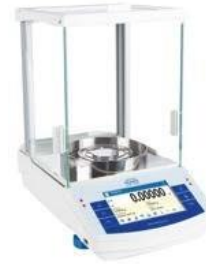
AS 220.X2 PLUS 0,1mg Analytical Balances