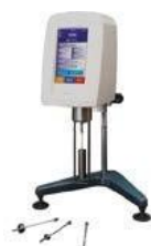
Snb1-T Touch Screen Viscometer