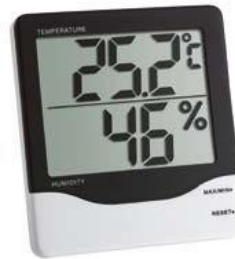
30.1040 Digital probe thermometer