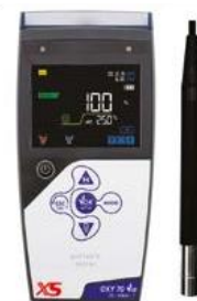
OXY 70 Vio Dissolved oxygen measurement, % saturation and barometric pressure with temperature indicator. Manual and automatic data logger with the ability to download data to PC via micro USB