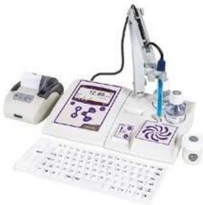
COND 80 Digital microprocessor with large backlit color graphic display. Automatic scale switching, automatic and manual temperature compensation