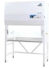
LN 120 LAMINAR AIR CABINS