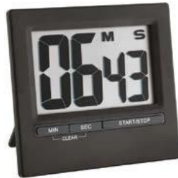
30.1018 Digital Food Type Thermometer

► With a range of more than a thousand different weather and measuring instruments, TFA Dostmann GmbH & Co. KG is one of the leading companies in the industry in Europe