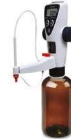
Digital Burette Models