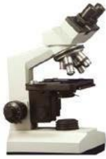
Binecular Microscope Zj-Xsz-107bn Model

As Ertick, we provide all the device needs of food and industrial laboratories