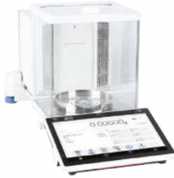
XA 52.5Y 0,01mg Analytical Balances