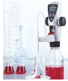
Digital Dispenser Models