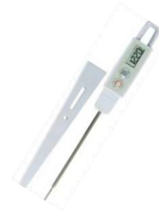
30.5002 Digital Thermohygrometer